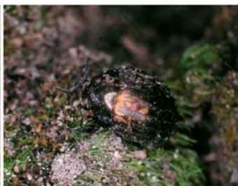
Fig 4: Bryophagous beetle Cytillus sericeus