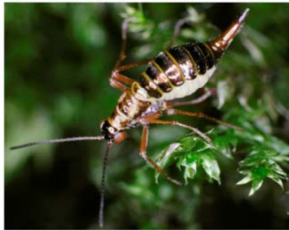
Fig 2: Snow scorpionfly Boreus westwoodi (Hexapoda, Mecoptera)