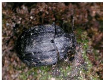
Fig 3: Bryophagous beetle Byrrhus pilula

From a total of 56 coleopteran taxons (mostly species) from pitfall traps, only one specimen of bryophagous beetles ( Simplocaria sp., Byrrhidae) was recorded. We found out a higher species richness of the moss habitat insect communities (about 25 % of insect species was recorded only there). RDA with Monte-Carlo permutation tests shows moisture as a main significant factor (Fig 5) affecting insect habitat preferences ( p = 0.028 , F = 1.81 ), while impact of moss layer presence was not significant. We presume that habitat preferences of some insect species known as bryobionts could be explained just as affinity to microclimatic factors. For example insect species in habitats with dry conditions tend to occupy moss cushions and that is why they are considered as strict bryobionts. However we cannot validate this hypothesis, several authors discuss on similar conclusions (SMETANA 1958, HURKA 1996, ANDREW et al. 2003).