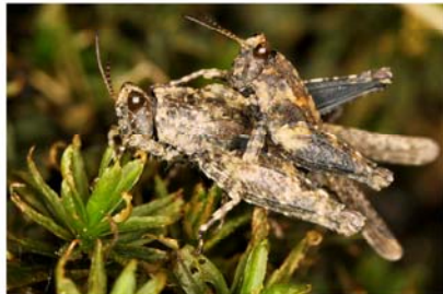
Fig 1: Tetrix ceperei (Hexapoda, Caelifera) feeding on Atrichum undulatum